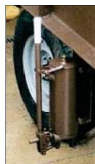
HYDRAULIC HAND PUMP