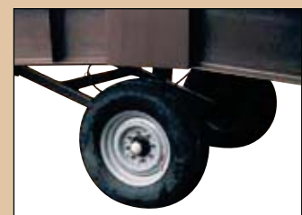
27" PNEUMATIC TIRES