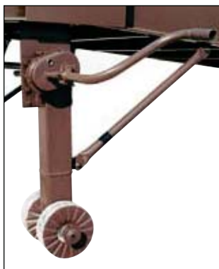
MANUAL HAND CRANK & 9" STEEL WHEELS