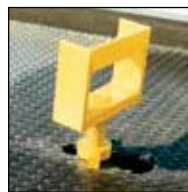
TOW BAR LOOP