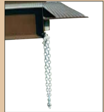
SAFETY LOCKING CHAINS WITH 15" OVERLAP LIP