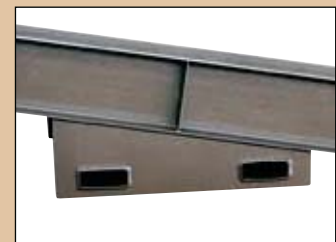
FORK LIFT PICK-UP SLOTS