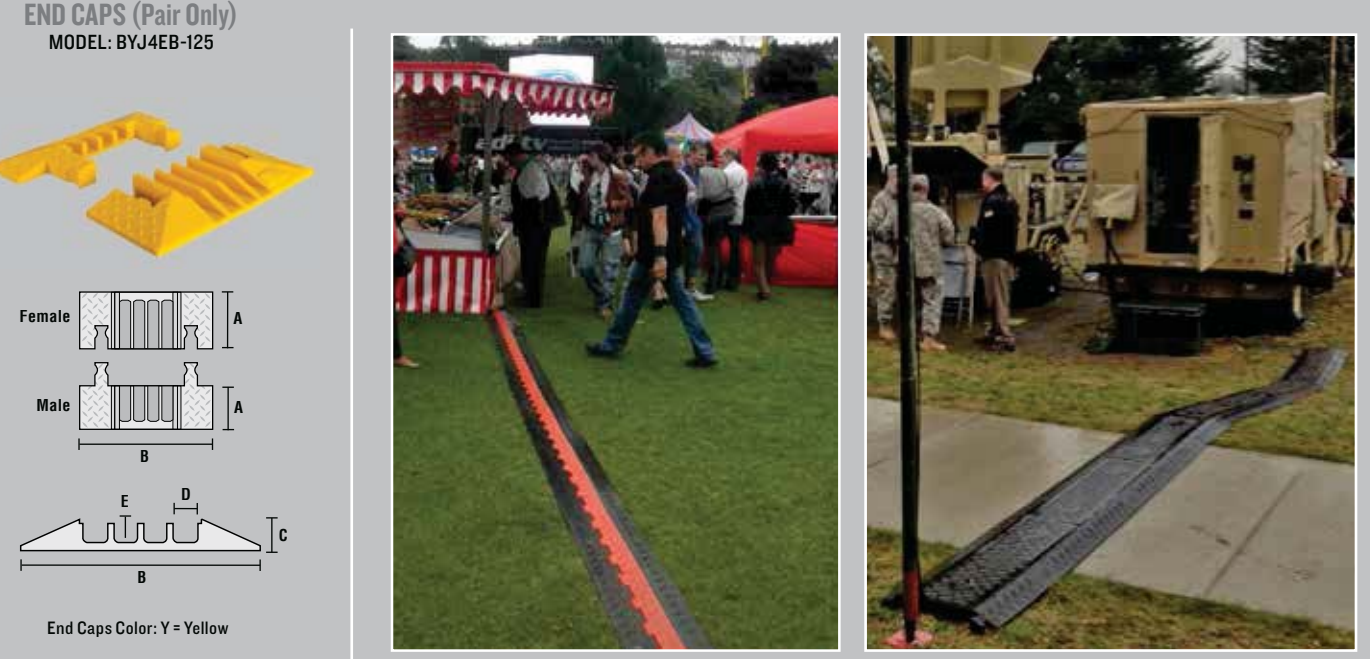
Low Profiles in use at a outdoor event