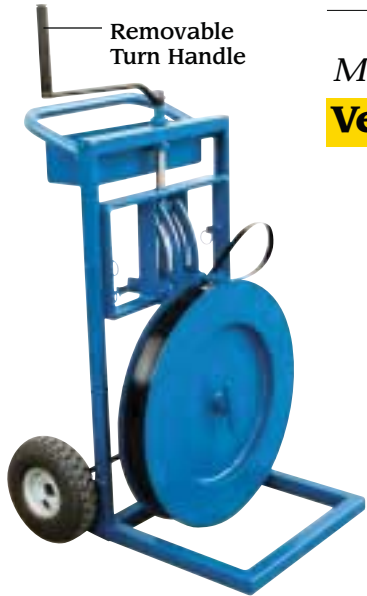
Removable Turn Handle

The Banding Cart , model BSTRAP-P2 , is a quick and simple answer to a long time dilemma. To use simply transport unit to your loaded pallet, extend arm and run strapping to end clip. After strapping is secure roll cart into pallet along center stringer (A). The strapping/arm will then protrude out the other end allowing the operator to pull the strapping up and over pallet (B). Unit accepts polypropylene strapping.