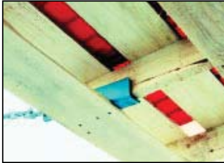
ATTACH PROOF COIL CHAIN (MODEL BPPC-20 or BPPC-40)