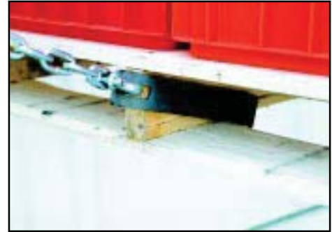
PULL LOADS UP TO 4,000 LBS. OUT OF TRAILERS

The BPAL-2 is a simple, strong, light weight tool for hooking hard to reach 2-way stringer pallets. Simply slide the Pallet Puller under the upper deck board and place around the first two-way stringer. Pull back on the Pallet Puller to lock in place with positive grip. Attach the puller to the fork truck with a proof coil chain (model BPPC-20 or BPPC-40 )