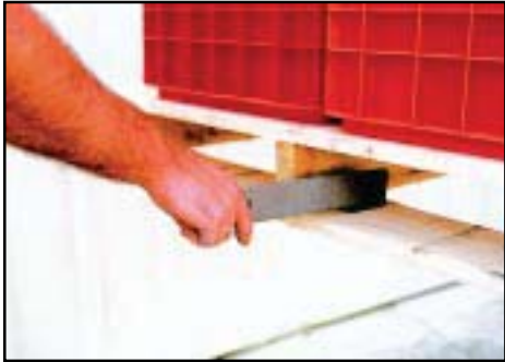
PLACE AROUND THE FIRST TWO-WAY STRINGER