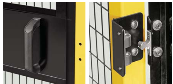
Standard doors include pull handle and built-in door catch.