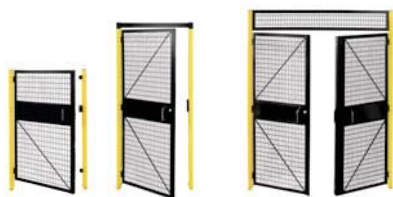
Hinge (right door: header included with 7-ft. system) Hinge Pair (transom included with 8-ft. system)

Posts are sold separate and not included with door purchase.