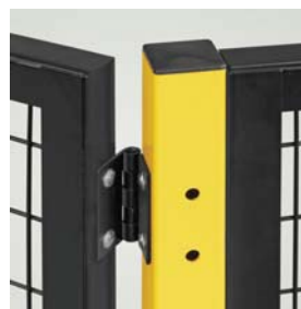
Angle panel kit lets you position panels in just about any configuration you require.