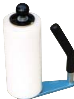
PALLET SHRINK WRAP Model BSW-HAND-R