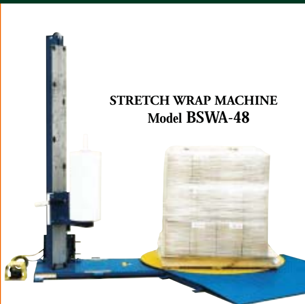
STRETCH WRAP MACHINE Model BSWA-48