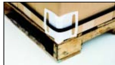
CORNER PROTECTORS Model BEDGE

Beacon Industries, Inc. 12300 Old Tesson Rd. St. Louis, MO 63128-2247 USA Phone: (314) 487-7600 Fax: (314) 487-0100 beacontechnology.com E-Mail: sales@beacontechnology.com