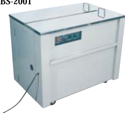
AUTOMATIC STRAPPING MACHINE Model BS-2001

From Stretch Wrapping to Carousels to Strapping Machines your packaging equipment needs are covered. We offer a variety of products that assist in packaging whether by machine or done manually. Increase productivity in your shipping area with Packaging Equipment. Special sizes available.