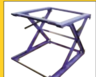
3 rd Setting 35-1/4"