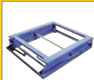
Lowered Height 10"