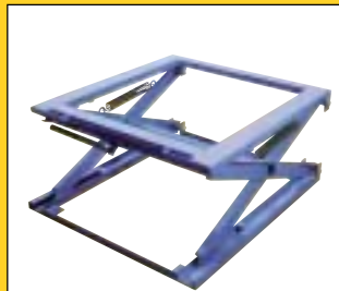
1 st Setting 20-1/4"