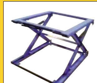
2 nd Setting 30-1/2"