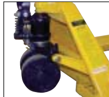
Hydraulic Pump includes Overload Relief Valve. Pump Bypasses at Full Height