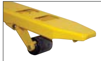
User Friendly Entry and Exit Rollers with Adjustable Push Rods