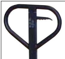
Three Position Lever Raise, Neutral and Lower