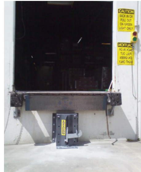
Truck Restraint with Block Out Frame structure for EOD application.

Beacon offers a 1-year warranty on all structural members. A 1-year warranty is provided on mechanical and miscellaneous parts.