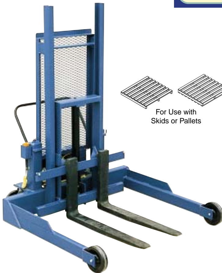
For Use with Skids or Pallets