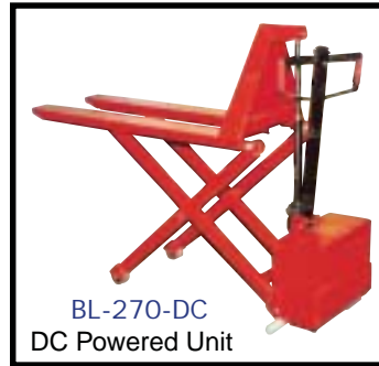
BL-270-DC DC Powered Unit