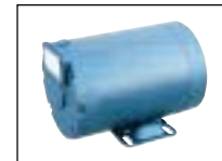
56 Frame Motor