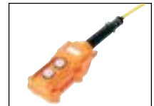
Hand Held Pendant Control