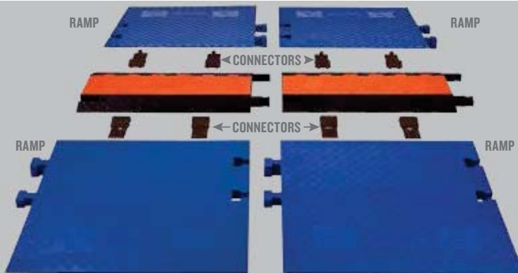
System shown with 2 General Purpose Guard Dogs, 2 pairs of ramps, 8 connectors.