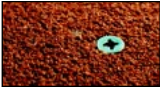
Abrasive surface provides incredible traction wet or dry.