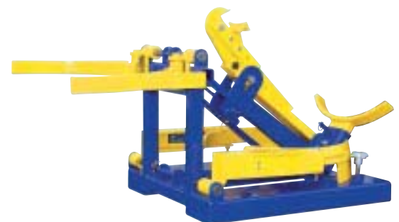
Shown with Top Lip Poly Drum Lifter in Use