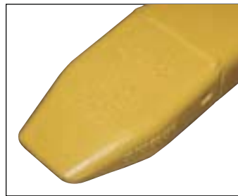
Sloped Top and Bottom Tapered Both Sides

Fork extension provides the extra support needed to lift long or large objects with a fork truck. Steel retaining strap (loop style*) prevents fork extensions from sliding off forks during use. Powder coat yellow finish. OSHA regulations require that extensions are no more than 150% of the existing fork length. (e.g. 48" existing forks, the fork extension should not exceed 72")