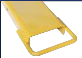
FULL LOOP • standard*