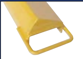
TRIANGULAR • suffix T*