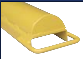
ROUNDED • suffix R*