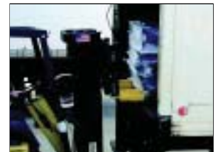
Rear Spacer Fork Extensions