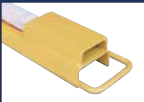
REAR SPACER • suffix RS*