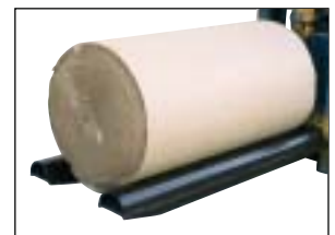
Round Shaped Extensions