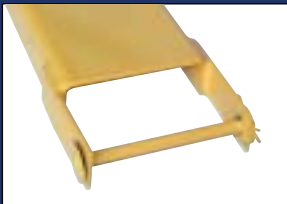
PIN STYLE • suffix P