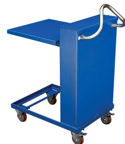
Take off Backplate to Add or Remove Springs