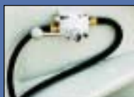
Easy Lever Control