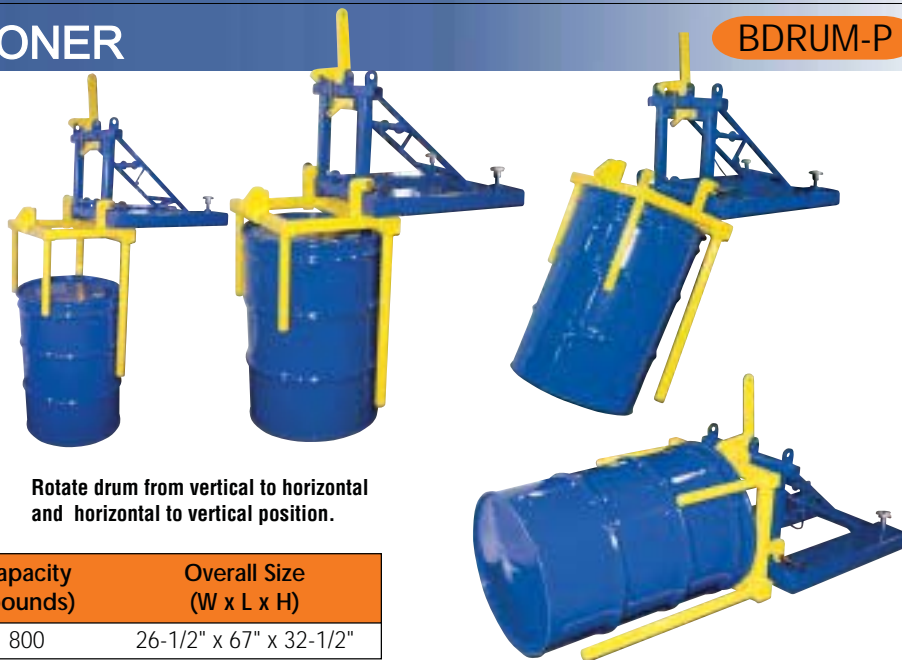
Rotate drum from vertical to horizontal and horizontal to vertical position.

New innovative design allows fork truck driver to invert standing drums to the horizontal racking position. Positive latching system ensures safe handling up to 800 lbs. capacity. Slide the positioner extensions over the vertical drum. With the aid of the Rack Drum Positioner rotate drum to horizontal position. Latching system will engage to allow horizontal positioning of drum. It's now ready to slide into the rack. Fork pockets measure 6-1/2"W x 2-1/2"H usable on 19-1/2" centers.