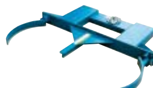
BDGD-55 Fork Pockets: 2-1/2" x 7-1/4"