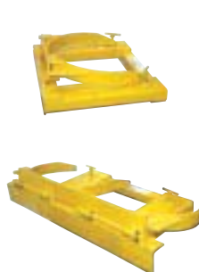
Model BDGS-55-D Folded Dimension: 28"W x 24"D x 8-1/2"H Fork Pockets: 2" x 6-1/4"

The Drum Gripper makes it easy to pick up (1) or (2) drums without leaving the fork truck. Simply slip the fork tines into the fork tubes and the Drum Gripper is ready to go. The knuckle gripping system is lowered around the drum, gripped tightly, and then lifted into the air. Drum is automatically released by lowering the forks. BDGS-55-D and BDGD-55-D feature hinged folding design.