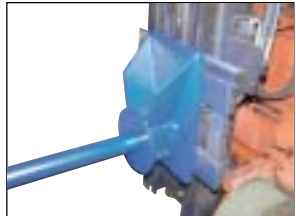
Carriage Mount is available in Class II or III