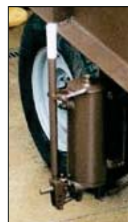
HYDRAULIC HAND PUMP