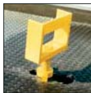
TOW BAR LOOP