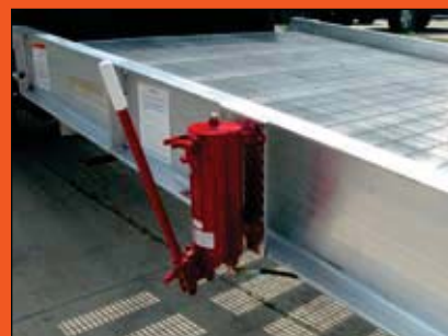
HAND PUMP HYDRAULIC LIFT