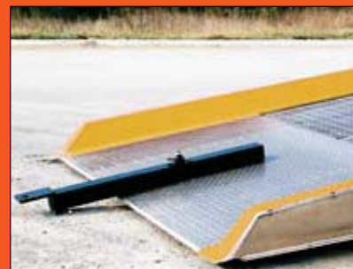
TOW BAR HITCH Shown with Optional Yellow Curbs