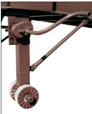
MANUAL HAND CRANK & 9" STEEL WHEELS