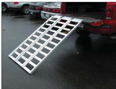
Aluminum Pick-Up/Van Ramps