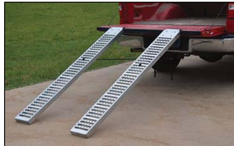
Steel Pick-Up/Van Ramps