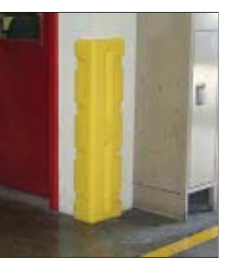
Scratch Resistant Great for Indoor or Outdoor Use