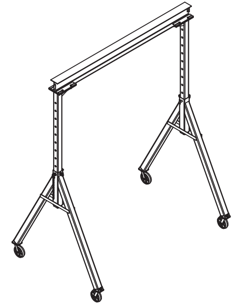
3D VIEW FOR REFERENCE ONLY