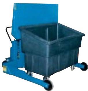
(1) Polyethylene Tote, model BMPT-1, comes standard with each unit