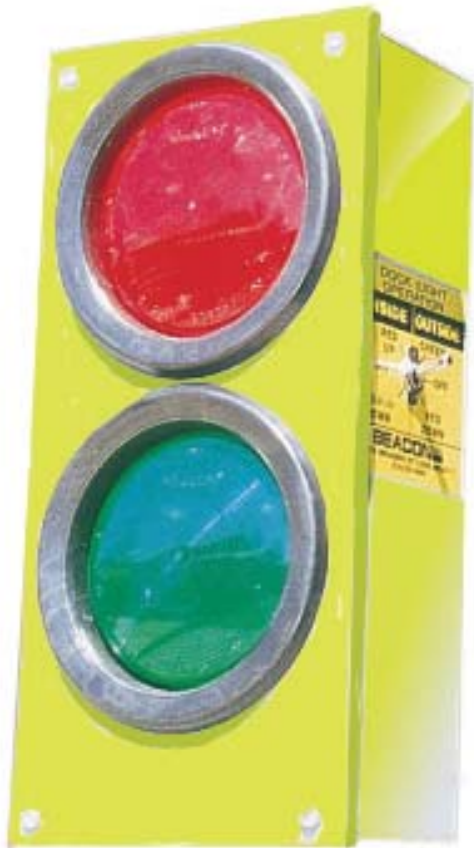
INSIDE SAFETY TRAFFIC SIGNAL DOCK LIGHT