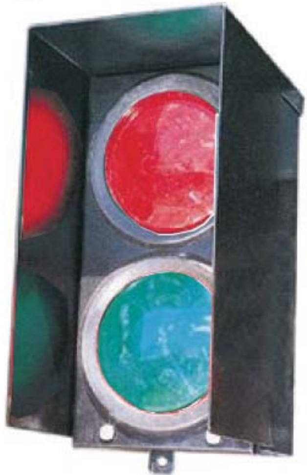
OUTSIDE SAFETY TRAFFIC SIGNAL DOCK LIGHT