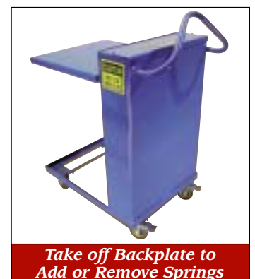
Take off Backplate to Add or Remove Springs