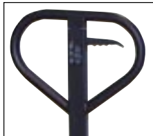
Three Position Lever Raise, Neutral and Lower