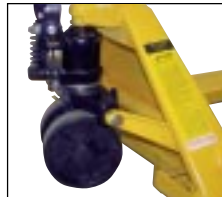
Hydraulic Pump includes Overload Relief Valve. Pump Bypasses at Full Height