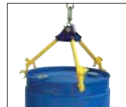
Overhead Lifter BPDL-800-M