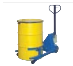
Drum Jack BDRUM-55S