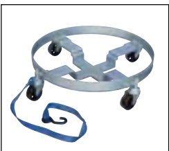
Quad Dolly BDRUM-QUAD-H