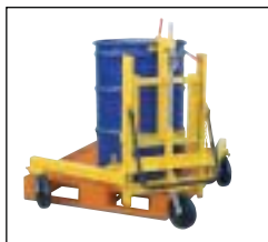
Drum Transporter BDCR-880-M