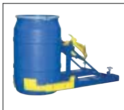
Poly Drum Handler BFPDL-8-L