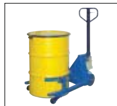
Drum Jack BDRUM-55S