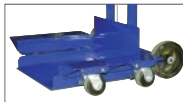
Load and Unload Product from Ground Level