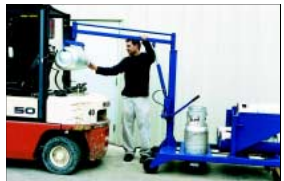
LOAD TANK INTO TRUCK FROM SIDE OR END OF CART

No lifting is involved when using this ergonomically correct cart; a boom will swing around and with automatic clamps on each end, will pick up the full 50 pound LP tank and swivel around to place the tank on a rack, shelf or the back of a fork truck. A knob on the bottom of the boom controls the speed for lowering the tank. Now one person can easily load or unload a rack or fork truck. This unit can be knocked down by one person for shipping and storage. Units are powder coated for long term wear.