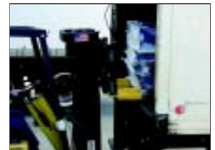
Rear Spacer Fork Extensions