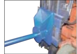
Carriage Mount is available in Class II or III