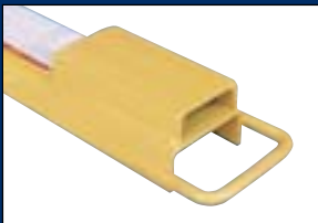
REAR SPACER • suffix RS*