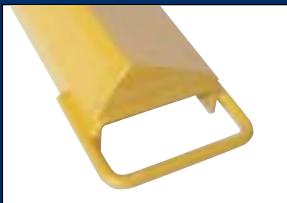
TRIANGULAR • suffix T*