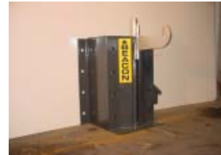
Truck Restraint with Block Out Frame structure for EOD application.

Note: When Pit Leveler lip length exceeds 18" or Pit depth exceeds 20" notify factory.