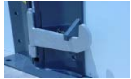
Hook locks out of the way for snow removal

Beacon offers a 1-year warranty on all structural members. A 1-year warranty is provided on mechanical and miscellaneous parts.